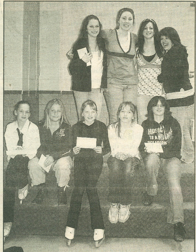
The Program Assistants for the Marmora Skating Club. These skaters, in addition to helping their younger skaters and mentoring them, are also eligible to apply their efforts to their high school community volunteering requirements.