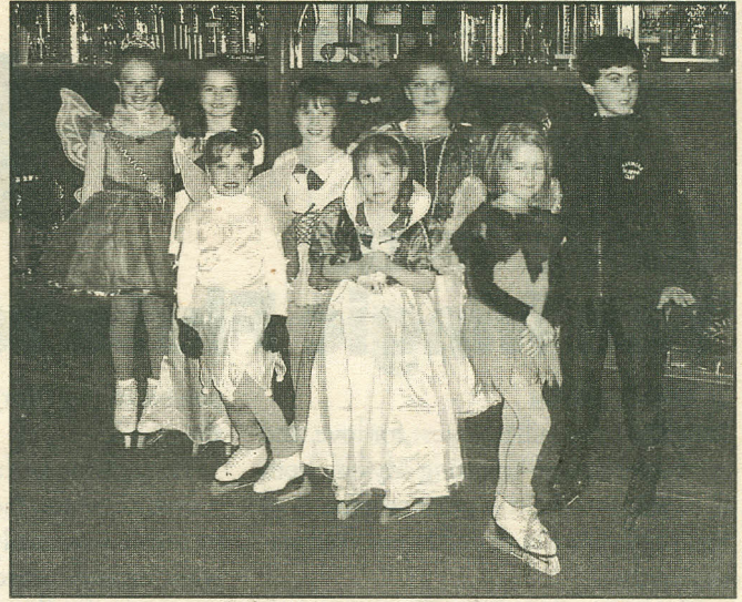
Skating group from Shrek pose just before taking to the ice at Sunday's Marmora Skating Carnival, "An Afternoon at the Movies."