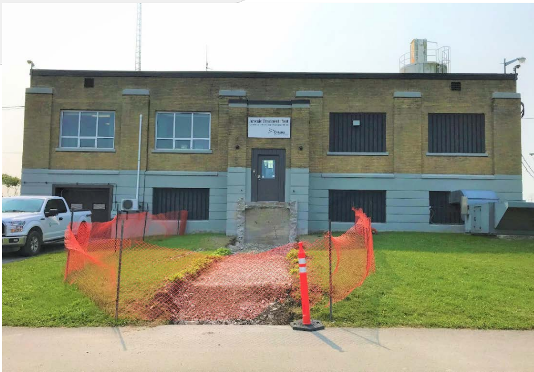
Photo of Arsenic Treatment Plant undergoing outside maintenance.

The Arsenic Treatment Plant removes nearly 100 per cent of the arsenic contamination found in the site groundwater. The Deloro Project Team and the Ontario Clean Water Agency continue to ensure the building and plant are maintained so that treatment operations can continue to meet project goals and achieve environmental improvements.