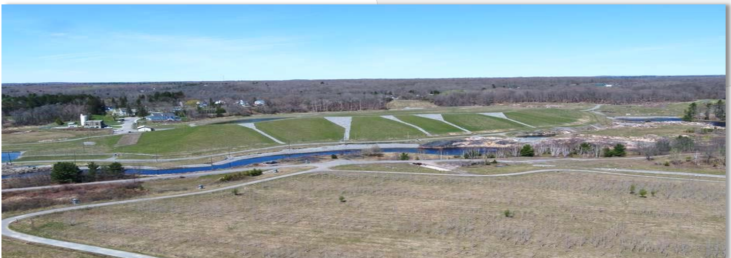
Photo of Deloro site.