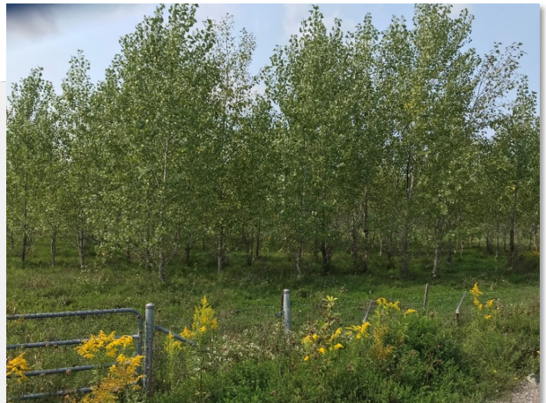
Poplar trees on site.

The Ministry of the Environment, Conservation and Parks holds Public Liaison Committee meetings once a year. Contact 613-548-6921 to attend. You can find out the history of the Deloro site on Ontario.ca. For other inquiries call our Kingston Office at 613-549-4000.