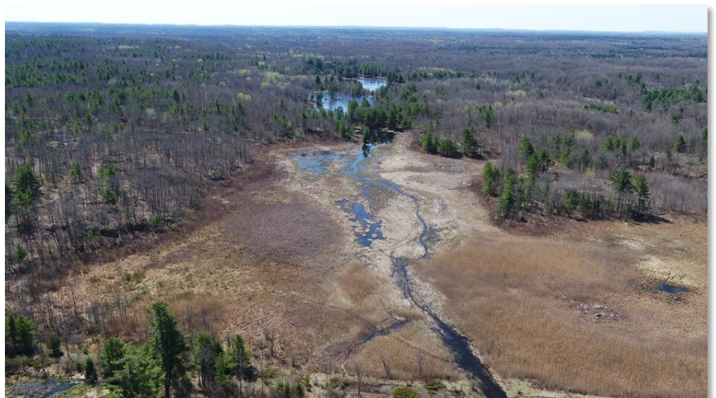
Site photo of geese and picture from aerial drone footage.

The site has been returned to a more naturalized state and continues to provide attractive habitat for wildlife. Local species seen on site include deer, rabbits, blue jays, otters, geese, frogs and insects.